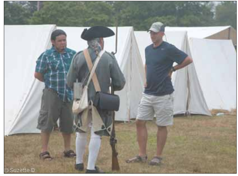
Right: A reenactor explains his historic clothing and equipment to En-