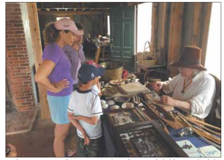
A demonstration of wampum making fascinated children and adults.

The colonial crafts program will be continued in 2018 and we will be seeking further grant funding for financial support. Please look for our announcements about this program, which will likely re-start in June 2018. We hope to see you learning colonial crafts in 2018!