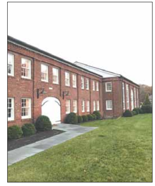
View of the now-restored Mill. The historic 1859 building is at left and the 1960 building (attached) is at right.

The restoration process, although lengthy, has been meticulous, including retaining as much of the original Mill building materials as possible, using salvaged materials where the originals could not be re-used, and incorporating new period-appropriate restoration materials. The exterior walls, roof framing, and remaining mill works were retained, with a new interior structure built to support the walls and hide insulation and utilities. The result is a beautiful restored sawmill building that will remind us of our community's history for years to come. The Society deeply appreciated the "saving" of our historic Mill and was very pleased to recognize the Foundation for its extraordinary efforts. The next time you are in Speonk, please pause as you drive by the Mill and admire the wonderful restoration by the John and Elaine Kanas Family Foundation!